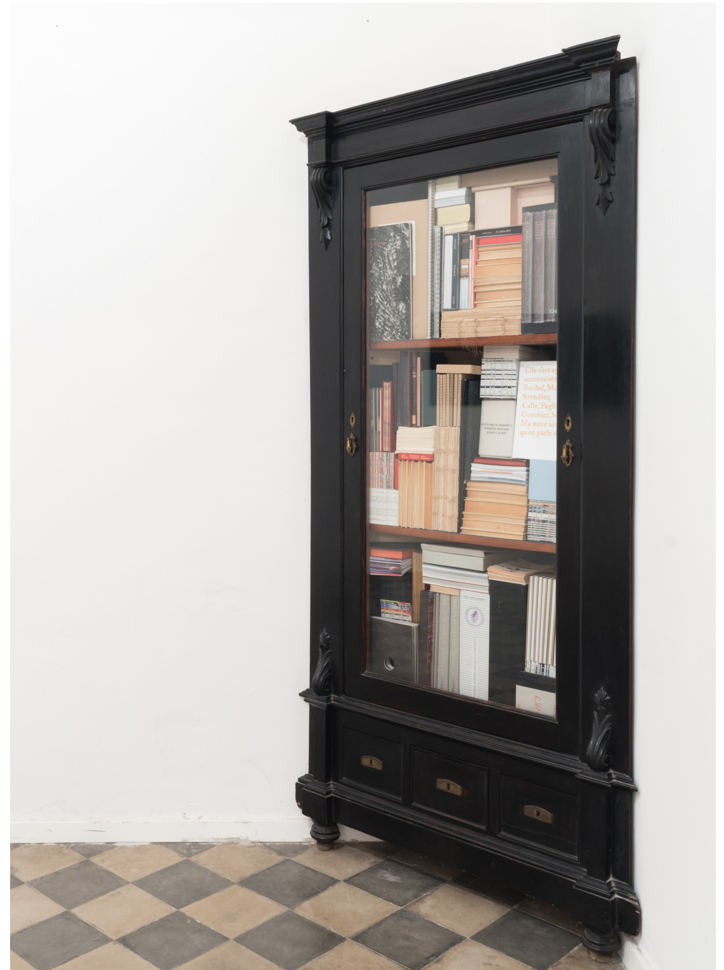
KOOBOOK – Deconstruction of the Archive, 2019. Found furniture, artist's books and magazines, object books, books and archive files, fanzines, catalogs, 230x70x60 cm