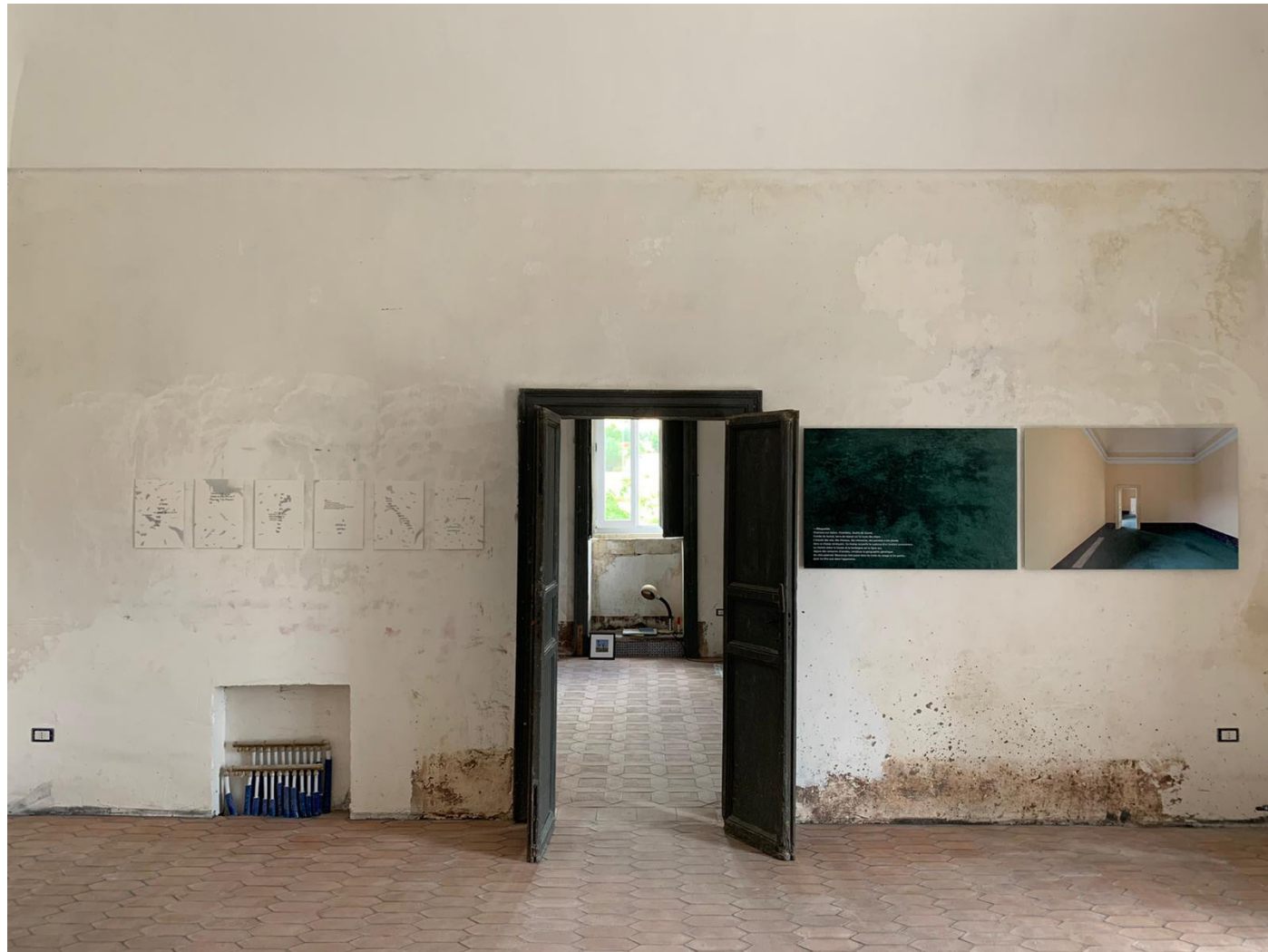
Dislocamento, 2021, Villa Iblea Exhibition, Modica, IT