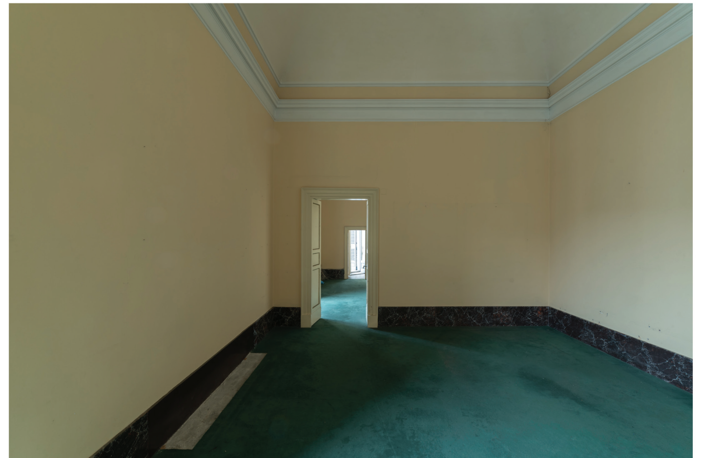
Dislocamento #1-2, 2021. Print on paper, Hahnemühle Photo Rag mounted on Dibond, 140 x 105 cm, Diptych

— Moquette . Chamoux-sur-Gelon, Chambéry. Duché de Savoie. Combe de Savoie, terre de transit sur la route des Alpes. L’écoute des vies, des chevaux, des mémoires, des pensées a été placée dans ce champ verdoyant. Ce champ accueille la cadence d’un trottoir poussiéreux. Le chemin entre la Savoie et la Sardaigne est la ligne qui, depuis des centaines d’années, constitue la géographie génétique du côté paternel. Beaucoup s’est passé dans les traits du visage et les gestes, pour ne dire que dans l’apparence.