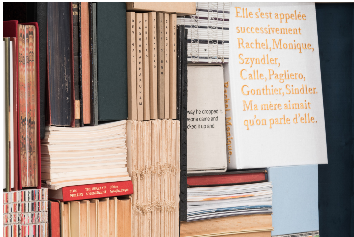
KOOBOOK – Deconstruction of the Archive, 2019. Found furniture, artist's books and magazines, object books, books and archive files, fanzines, catalogs. Detail